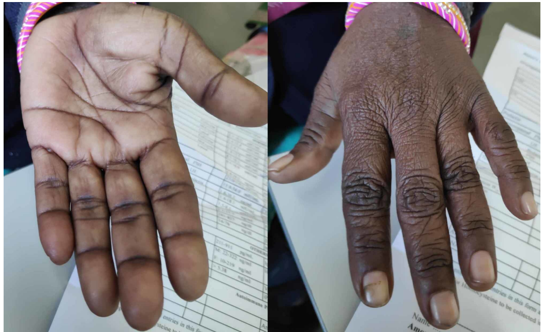
FIGURE 3: Hyperpigmentation of the palmar creases and dorsum of hands.

Respiratory, abdominal and cardiovascular examinations were unremarkable, and she did not have goiter or ophthalmopathy. Investigations revealed subclinical thyrotoxicosis with elevated anti-thyroid peroxidase antibody (anti-TPO) and low fasting cortisol with high concurrent adrenocorticotropic hormone (ACTH) (Table 1). Oral hydrocortisone replacement was started with thrice daily dosing: 7.5 mg in morning, 2.5 mg in afternoon and 2.5 mg in evening. This resulted in drastic symptomatic improvement. Menstrual cycles also normalized with treatment, suggesting that amenorrhea was due to adrenal insufficiency per se, rather than hypogonadism.