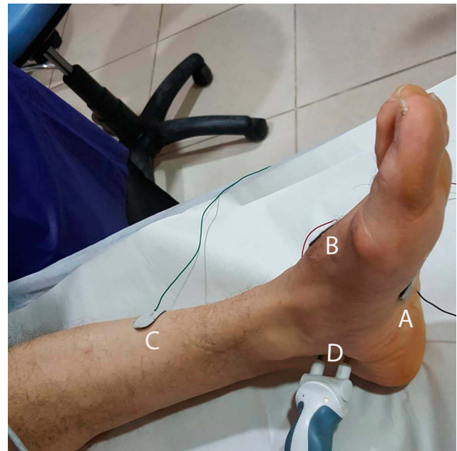
Figure 2 The sites of recording SSR from tibial nerve. (A) active electrode on the sole; (B) reference electrode on the dorsal aspect of the foot, (C) ground electrode on the leg and (D) stimulate tibial nerve on the posterior to the medial malleolus. Abbreviation: SSR, sympathetic skin response.

recording site and both ankles at the tibial nerves for each recording site. (Figures 2 and 3)