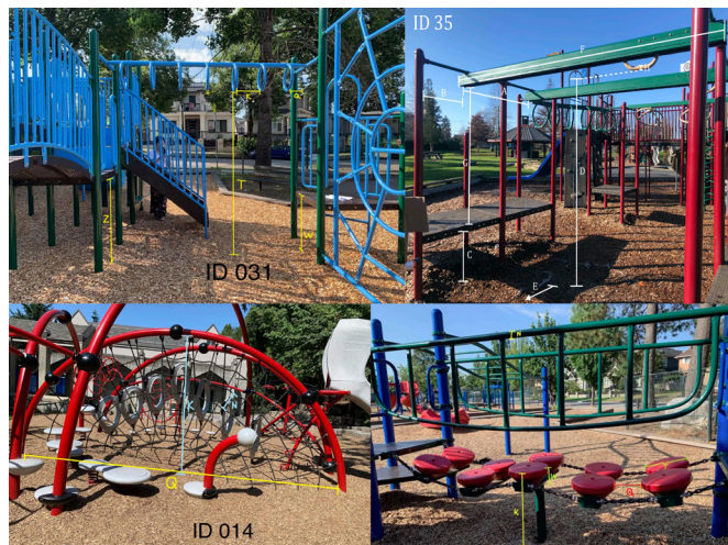
Figure 1 Examples of play structure types. Clockwise from top left: upper body structure, track ride, unclassified bridge and climbing net structure. The notations on the pictures were used by the research assistants to populate the data set in Excel.

fracture, 23 had type 2 fracture and the remaining 10 had type 3 fracture. Five children with type 2 fracture and all 10 children with type 3 fracture required surgery. The mean child age at the time of injury was 7.0 years (median age=7, mode=6, range from 5 to 10 years); those who were most seriously injured (type 3) were on average 6.8 years old while those with the least severe injury (type 1) were 7.3 years old.