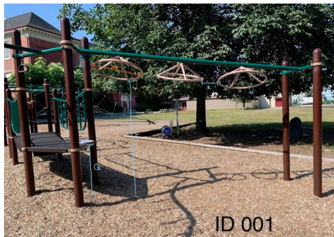
Figure 3 Example of rotating structure.

depths below those recommended by the CSA. These findings are consistent with other studies of playground SCHF in Australia and Canada showing that surface depths of loose fill materials, including EWF, were most often well below the recommended maintenance threshold. 17 18