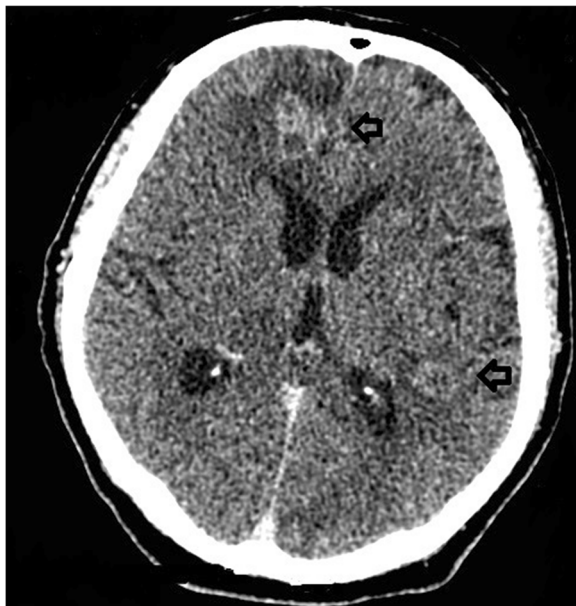
Fig. 2 Computed Tomography head with contrast. Computed Tomography head with contrast showing multiple ring enhancing lesions with surrounding oedema (see arrows)

CD4 T cell count was 50/\text{mm}^3 . A stereotactic biopsy of the right frontal lobe abscess was performed; PCR of the aspirate demonstrated the presence of Nocardia . PCR on a subsequent Broncho-Alveolar Lavage (BAL) confirmed a diagnosis of pulmonary and cerebral Nocardia . The patient