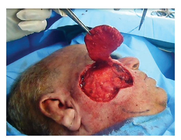
Fig. 2: Elevating the flap.