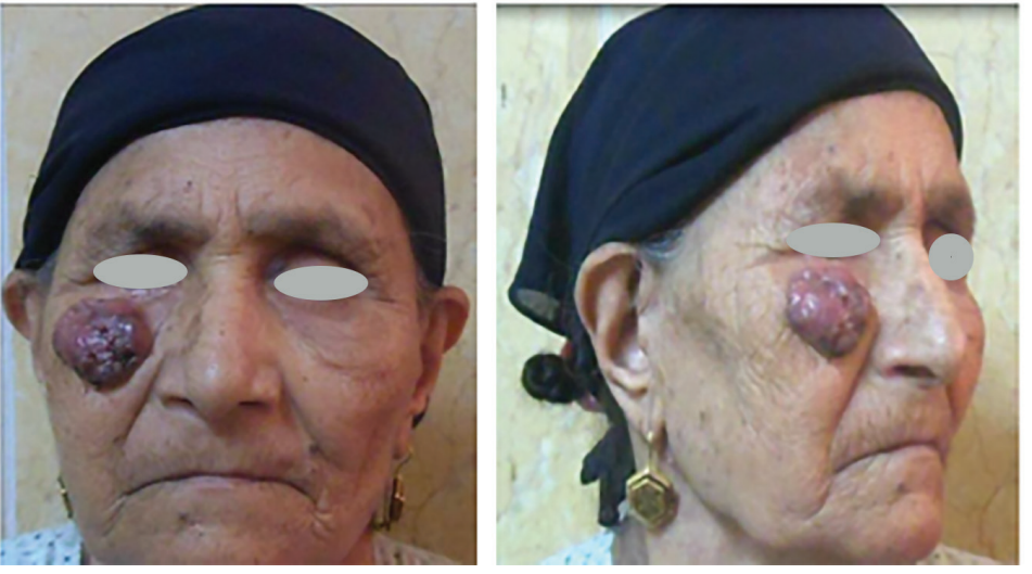
Fig. 5: Preoperative front and side views case 1.

D'Arpa et al. published a series of nasolabial perforator flaps for alar reconstruction and reported that facial artery perforators pierce the superficial musculoaponeurotic system layer due to absence of deep fascia in the face.<sup>14</sup> Qassemyar et al. reported in 20 cadaver dissections, the perforasomes of the facial artery perforators.<sup>10</sup> Gunnarson et al. published the advantages of using color Doppler ultrasound to localize facial artery perforators and this agreed with our technique in using Doppler identification of perforators in preoperative planning.<sup>4</sup>