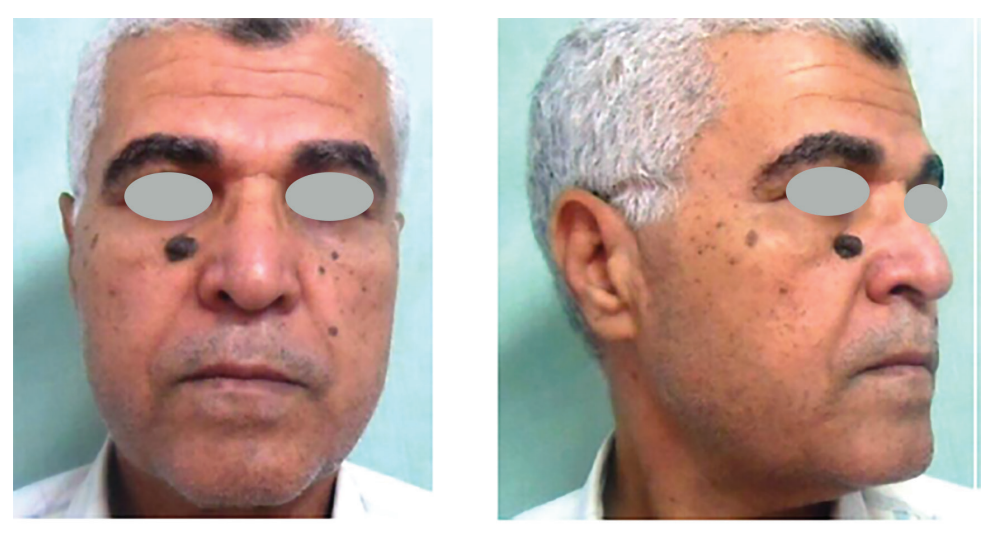
Fig. 7: Preoperative front and side views case 2.