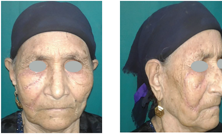
Fig. 6: Postoperative front and side views case 1.