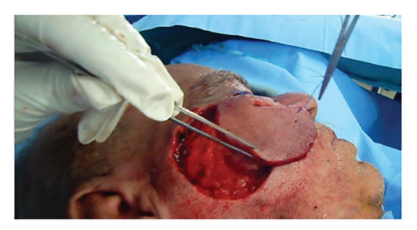
Fig. 3: Rotating the flap to cover the defect.