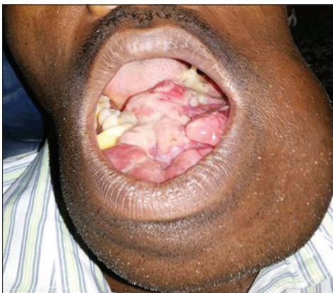
Figure 2: A case of squamous cell carcinoma of the floor of the mouth