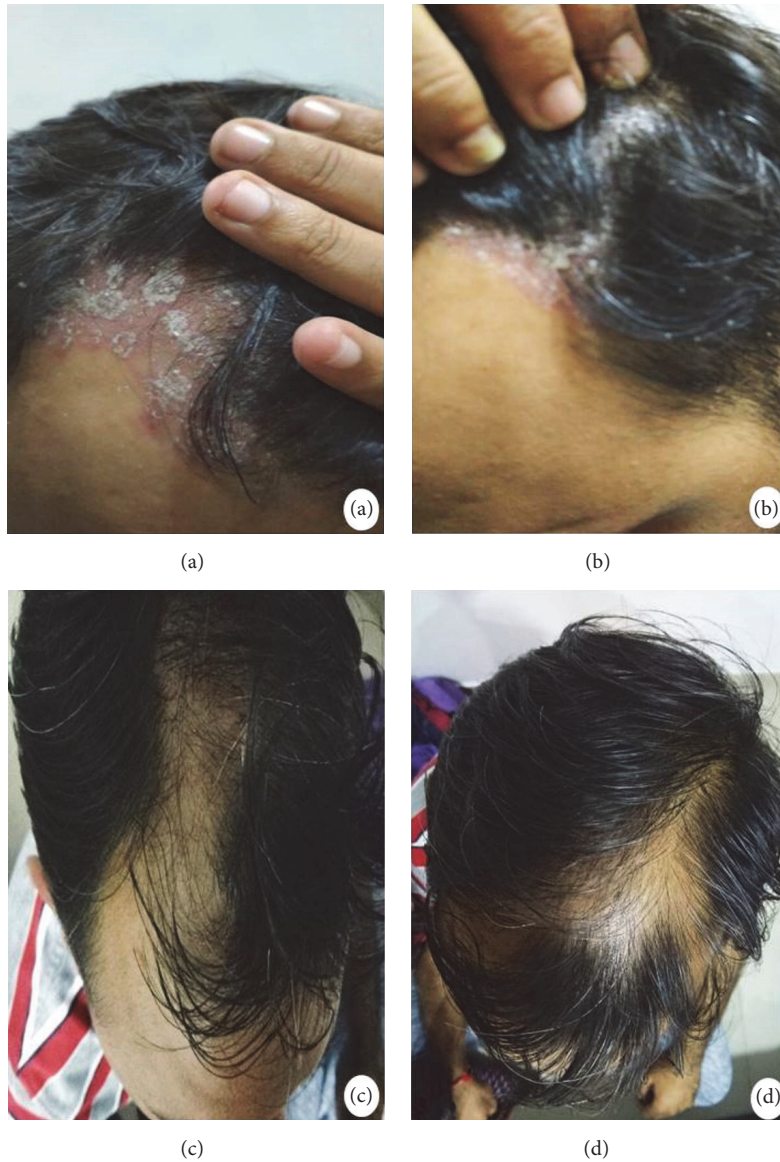
FIGURE 2: Effect of MSC-CM on psoriasis vulgaris. The scalp of patient showing numerous erythematous plaques with adherent silvery flakes before MSC-CM-treatment (a, b). Regression of psoriasis and a complete clearance of inflammatory erythematous plaques recorded after topical application of MSC-CM for a period of one month (c, d).

other associated diseases [3]. Therapies using multipotent MSCs have been shown to be effective in treating psoriasis and psoriasis-like other skin diseases. Clinical benefits may be attributed to MSCs engraftment or to their paracrine/immunomodulatory effects. However, transplanting MSCs come with few limitations like low survivability of cells in the host due to harsh microenvironment and cell loss because of poor or no cell adhesion [18]. Hence there is need of the hour to find an alternative for cell-based therapy.