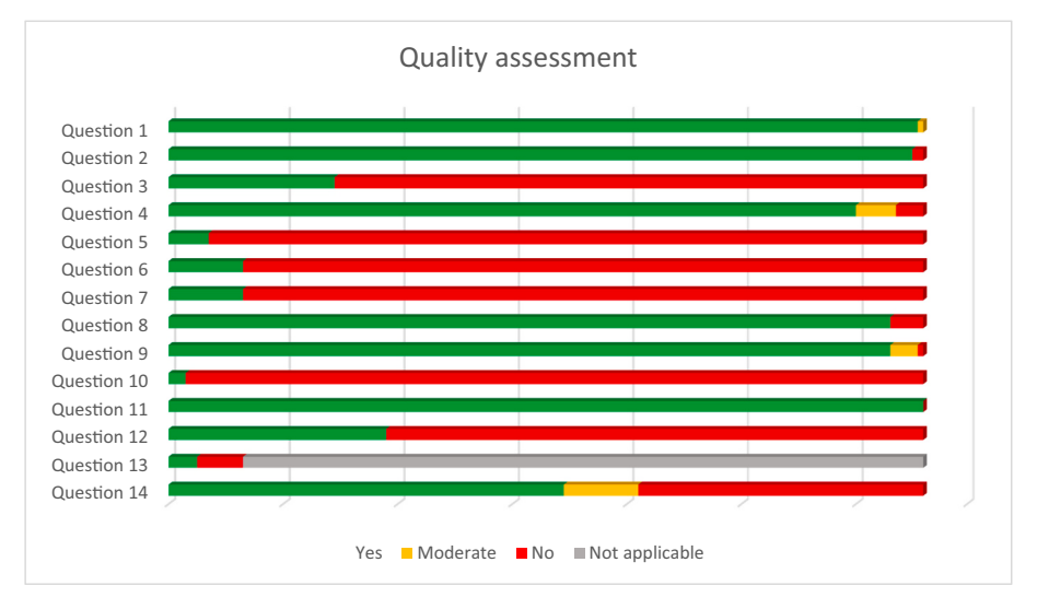
Fig. 3. Quality assessment.

There are several possible explanations for our findings. First, it may well be that the pathophysiology for intimal arterial calcification and medial arterial calcification differs. As stated before, it could be that tunica media calcifications originate from transformation of vascular smooth muscle cells into osteoblast-like cells (Lee et al., 2020). This transformation presumably results because of alterations in the investigated biomarkers of this systematic review. On the other hand, calcifications in the tunica intima seem to be more related to lipid deposits and infiltration of inflammatory cells (Lee et al., 2020). Biomarkers more related to these processes were not part of this systematic review. In most studies the differences between these dominant types of calcifications are not taken into account. Second, many studies have a crosssectional design which has limitations for etiologic associations. Although we might conclude that the serum markers seem to have no relevant diagnostic value for arterial calcification. Third, the measurement of serum markers and/or arterial calcification varies, as well as the investigated study populations. Fourth, there were quality issues in