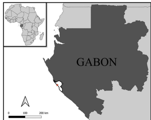
Fig. 1 Location of study site (red star) in Loango National Park (white), Gabon (dark gray). Maps were created using QGIS (v.3.10.5, QGIS Development Team, 2019), and shapefiles from the Map Library (Map Maker Ltd 2007) and Protected Planet (UNEP-WCMC and IUCN 2020)

The size of the Rekambo community ranged from 44 to 47 individuals during the study period, including 16–17 adult females and 8–9 adult males (see Table S2 in ESM).