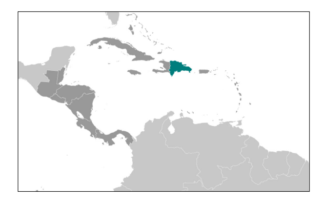
Figure 2. The Dominican Republic in the Caribbean.

The DR is a country of 48,442 km<sup>2</sup> or 18,704 miles<sup>2</sup>, roughly the combined sizes of the states of New Hampshire and Vermont. The country is politically divided into 31 provinces and Santo Domingo de Guzman is located in the National District. As part of the Greater Antilles of the Caribbean, it shares the island of Hispaniola with the Republic of Haiti as its western neighbor. The country borders on the north with the Atlantic Ocean and with the Caribbean Sea on the south. The Mona Passage, to the east, separates the DR from the Island of Puerto Rico (Figs. 2, 3). The estimated population for the DR in 2015 was just below 10.5 million with a large percentage of the population living in cities such as Santo Domingo and Santiago de los Caballeros, (See Table 1). An estimated 1-1.5 million Dominicans live outside the country. The population is mainly composed of different ethnicities, such as blacks (11%), mulattoes (73%), and whites (16%). This is the gross composition