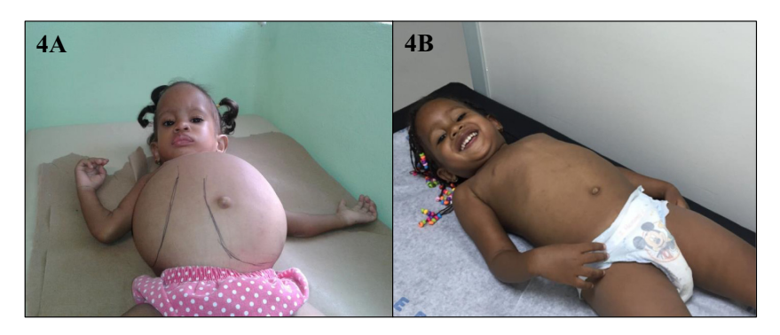
Figure 4. Dominican child with Gaucher disease. (A) Hepatosplenomegaly in a Dominican child with Gaucher disease prior to enzyme replacement therapy. (B) Regression of hepatosplenomegaly while on therapy with enzyme replacement therapy.

The Penal Code of 1948 (section 317) prohibits the performance of all abortions (Penal Code of the Dominican Republic 1948). Under the general principles of criminal legislation, however, abortion is permitted to save the life of the pregnant woman on grounds of necessity. Thus, in practice, both the legal and medical professions consider abortion performed to save the life of the woman to be