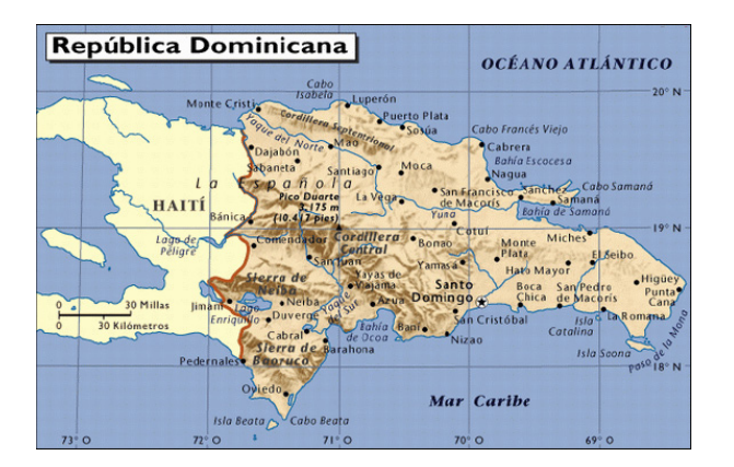
Figure 3. The political division of the Dominican Republic.