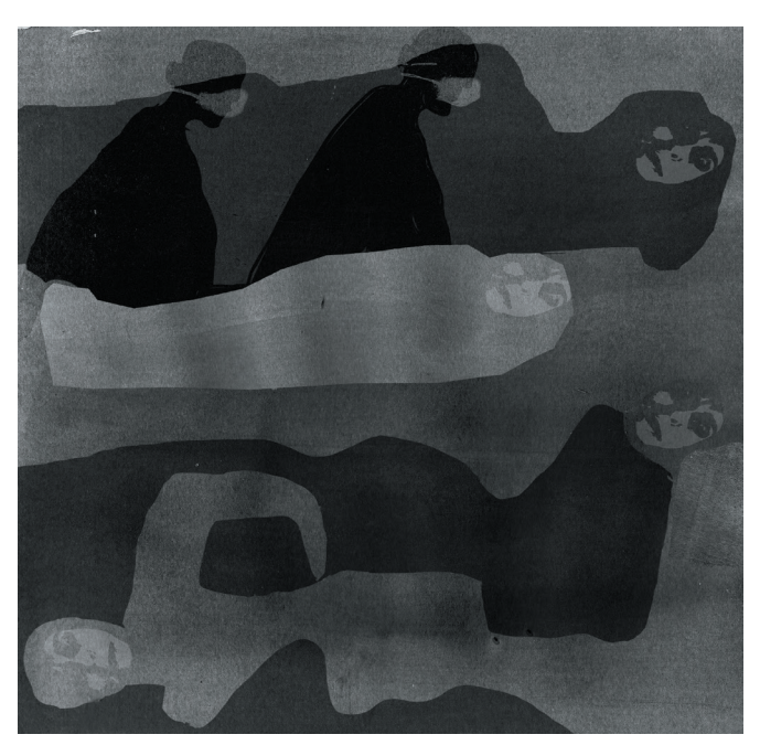
Figure 2 Complex ethical concerns arise in managing dead bodies in times of crisis. Adequate dead body handling signifies respectful treatment of the dead and has significant consequences for the living.

quickly, leading to the use of other less desirable alternatives; for instance, after the Indian Ocean tsunami of 2004, the courtyards of temples in Thailand were used for temporary storage of bodies, 33 and local authorities used dry ice to preserve the deceased, even though it disfigured the body.<sup>34</sup> COVID-19 victims were stored on ice rinks or in empty hospital rooms.<sup>20</sup> Other instances of local authorities using alternative methods for shortterm storage for bodies include, an example, from Indonesia after the Indian Ocean tsunami of 2004: 600 bodies were buried temporarily in shallow trench graves. A lack of preparedness in the death care sector is apparent in high-income and low-income settings alike. A study from the USA, published in 2011, warned that 'a highly lethal pandemic could lead to large numbers of deaths' and would overwhelm the responders.<sup>35</sup>