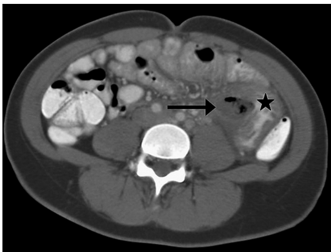
Fig. 1. A CT scan of the abdomen and pelvis demonstrated a thickened loop of jejunum (star) in the left abdomen with an adjacent air-fluid-filled mass (arrow) measuring 2.9 cm in the largest diameter.

All the authors listed declare that there are no conflicts of interest and that they accepted no financial sponsorship in producing and presenting this article.