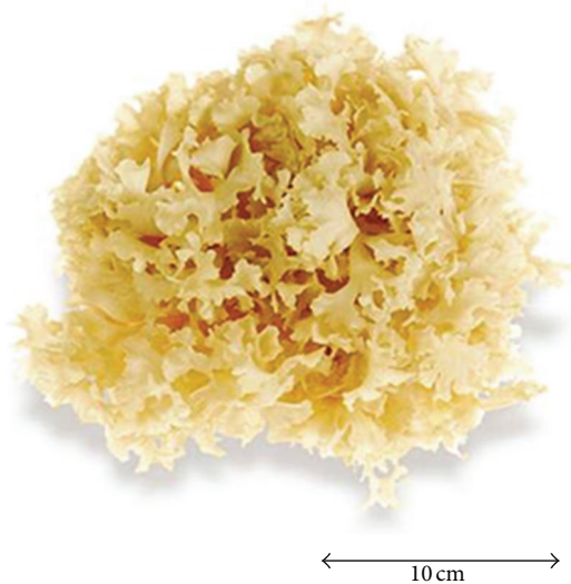
FIGURE 1: Sparassis crispa Wulf.:Fr. [2].