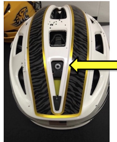
Figure 2 Sensor placement.

Seventeen Division I NCAA men's lacrosse players (height 173.89 \pm 2.45 cm; weight 72.65 \pm 3.32 kg) volunteered to be part of this study. Participants gave written informed consent. The Institutional Review Board of Towson University approved the study. The study included two goalies, three defenders, six midfielders, two face off specialists and four attack players. The athletes ranged in age from 18 to 22 years. A concussion history was obtained from each athlete during a preseason physical examination.