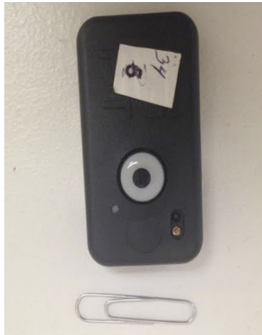
Figure 1 GForce Tracker sensor.

circumstances of concussive impacts and clarified both the site of impact and the striking object. 8 9 A baseball study described the helmet location of ball impacts as well as responder assessment after impact. 10 Video analysis provided information about impact characteristics and injury mechanisms in ice hockey competitions. 7 11 12 Some of the earliest examples of video analysis in sport come from football where it was used to simulate collisions to determine impact biomechanics. 13 Mixed martial arts research identified impact location and mechanism of knockouts through video review. 14 In addition to demonstrating impact location, mechanism of injury and event descriptions in cricket, video analysis has also been used to evaluate helmet safety within the sport. 15 Video review of head injury mechanisms in elite soccer matches highlighted game play scenarios with a high risk of head injuries. 16 While this is the first study to use video analysis in men's collegiate lacrosse, it has characterised head injury events in both boys' and girls' high school lacrosse competitions. 17 18