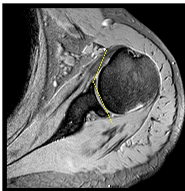
Figure 3. Coracoglenoid angle, in axial T2-weighted FFE images (white*; coracoid distal tip).

The coracohumeral angle was measured as an angle between the line tangential to the lateral surface of the humerus head from the coracoid tip and the line tangential to the medial surface of the humerus head from coracoid tip on the axial images (Figure 4).