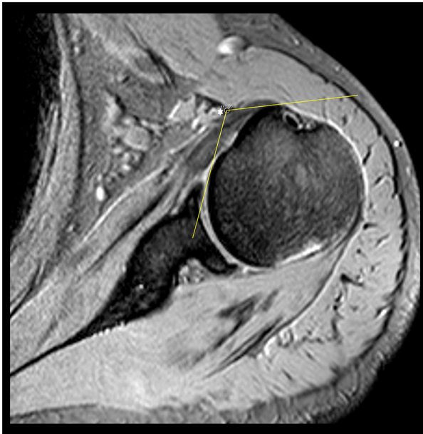
Figure 4. Coracohumeral angle, in axial T2- weighted FFE images (white*; coracoid distal tip).

coracoglenoid angle, coracohumeral distance and coracohumeral angle, and coracoglenoid angle and coracohumeral angle. P < 0.05 was considered statistically significant.