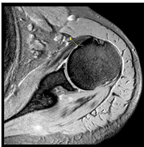
Figure 2. Coracohumeral distance, in axial T2-weighted FFE images (yellow*; coracoid distal tip).

The coracohumeral distance was measured at the narrowest point between the coracoid and the humerus on the axial images [10] (Figure 2).