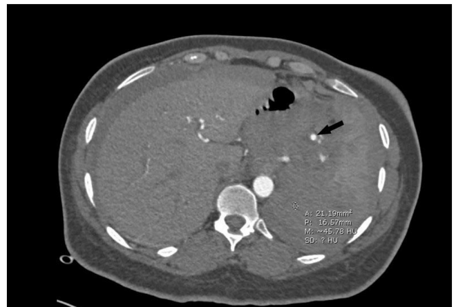
Fig. 2. Shows Abdominal CT angiogram arterial phase, the arrow points at the site of the aneurysm.

The macroscopic histopathological examination of the resected