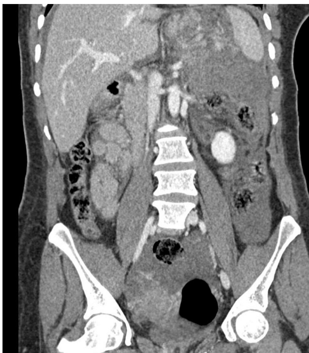
Fig. 4. Shows a coronal reconstruction CT scan in the venous phase showing extensive hemoperitoneum.

specimen from the splenectomy included a spleen measuring 10 \times 6.5 \times 4 cm with an attached fragment of the hilum measuring 8 \times 6 \times 3.5 cm and a fragment of the omentum measuring 8 \times 6 \times 3 cm. The spleen was weighed at 175.7 g. Step sectioning of the omentum revealed black cut surface with multiple yellow foci while step sectioning of the hematoma showed a hemorrhagic black cut surface. The splenic vessels could not be identified with certainty because of the hematoma. Step sectioning of the spleen was unremarkable. Microscopic histopathological examination of splenic tissue sections showed congestion along with fragments of fat necrosis and hematoma. Sections taken from the hematoma revealed splenic artery with blood dissecting through the media, indicating the presence of wall rupture.