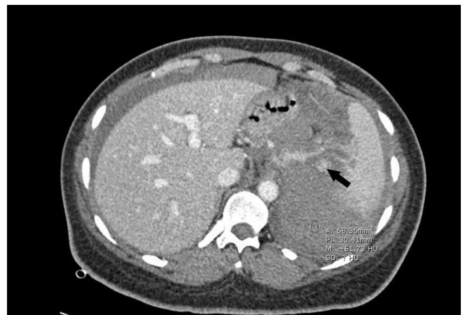
Fig. 3. Shows abdominal CT angiogram venous phase with an arrow pointing at the site of the aneurysm and a circle indicating extensive hemoperitoneum (50 HU), no active contrast extravasation could be seen.