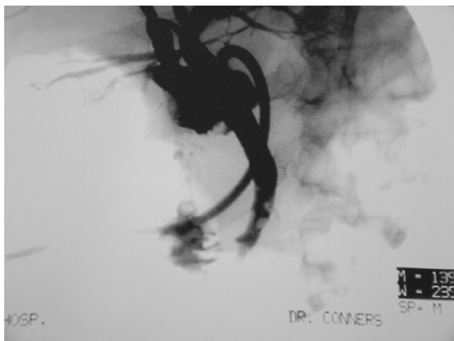
Figure 2. The T-tube cholangiogram demonstrates the presence of at least 1 gallstone in the common bile duct.

At this point, the patient was taken to the operating room with the intention to perform EHL via the T-tube tract.