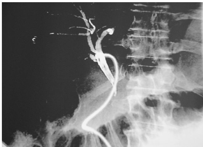
Figure 1. Intraoperative cholangiogram showing the flow of contrast into the duodenum.