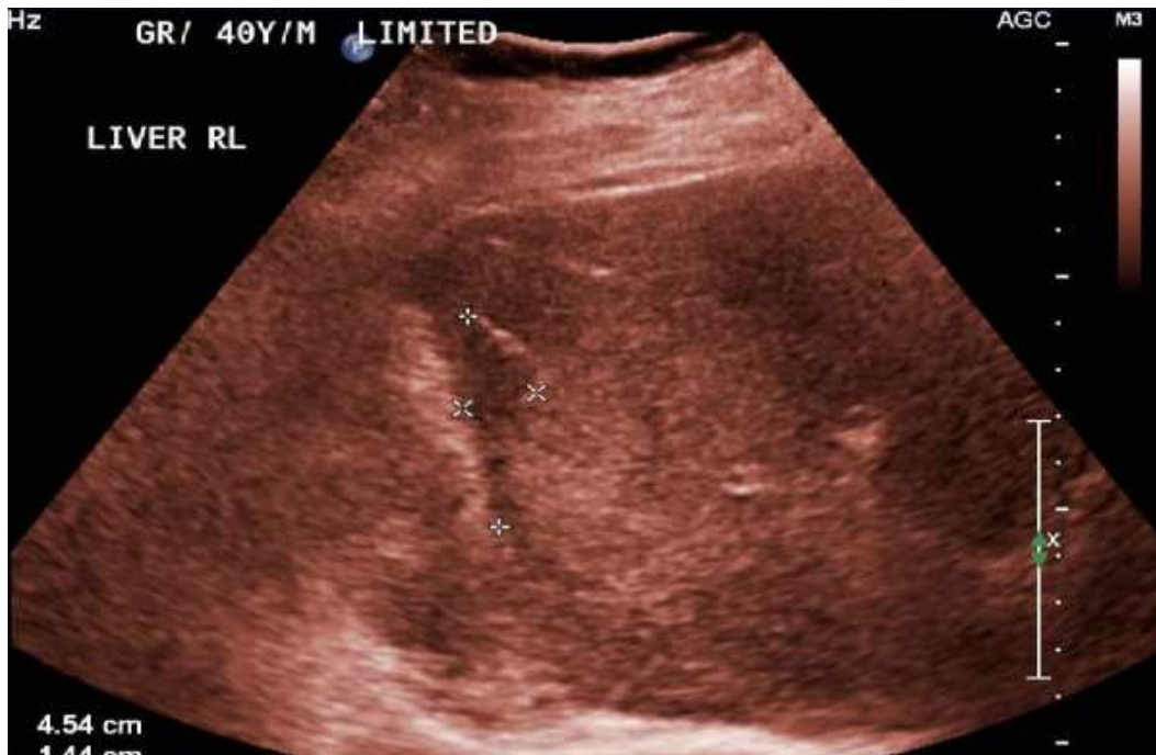
Figure 2: sonography showing near complete resolution of the hematoma