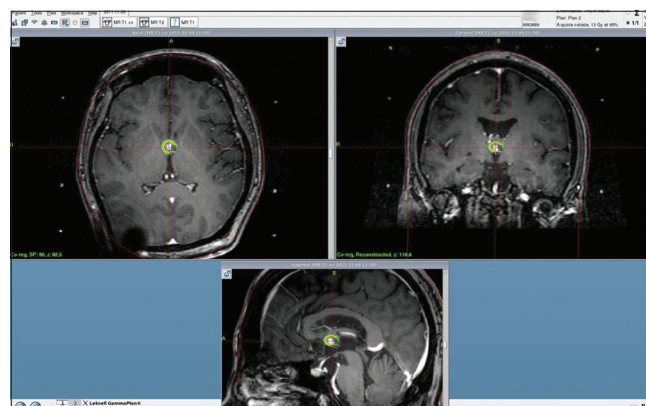
Figure 2: Gammaknife plan summary showing axial, coronal and sagittal T1 weighted with contrast MRI views. 13 Gy at 65% was prescribed