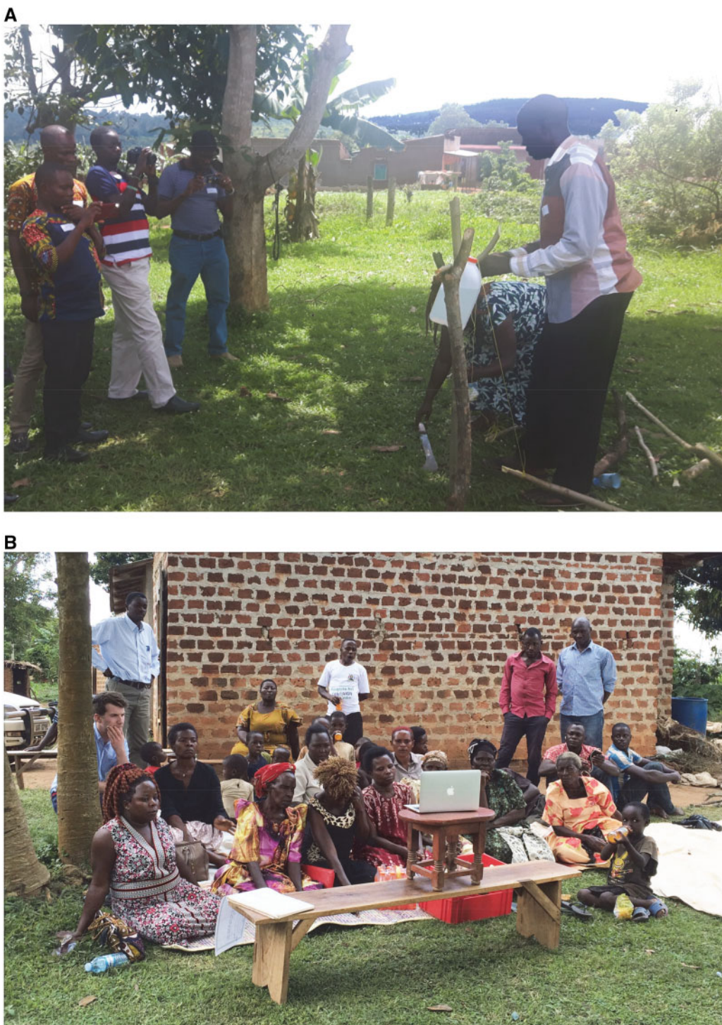
Fig. 2: Two Ugandan CHWs demonstrating how to construct a low-cost tippy-tap for hand washing (A). In the background Ugandan and Ghanaian CHWs can be seen videoing the demonstration. In (B) villagers watch the workshop video (05:39 min; Elimu Health 2018 ).