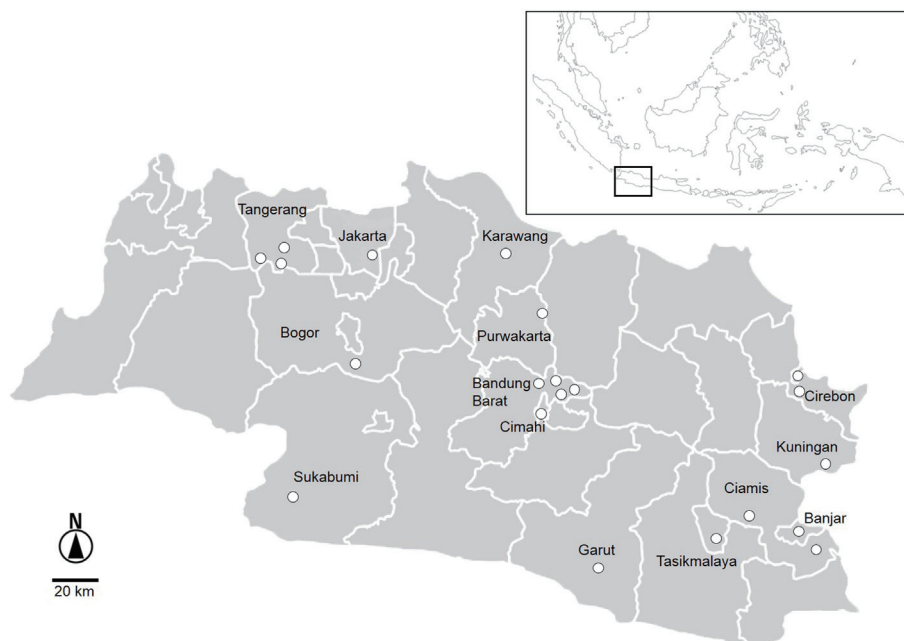
Fig. 1. Geographical distribution of the collection sites used in this study. White circles represent the location of sampled farms. The name of the district or city is displayed on the map.