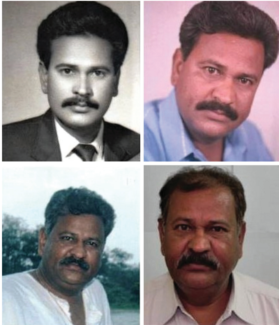
Fig. 7. Sequential photographs of a man from South Indian ethnic group.