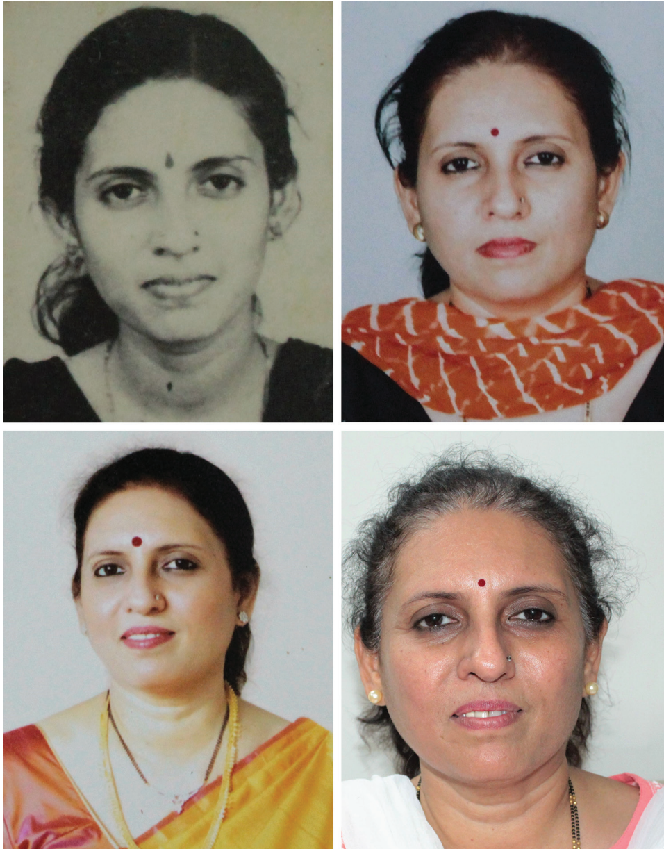
Fig. 6. Sequential photographs of a woman from West Indian ethnic group (2).

hallmarks in distinguishing the Asian upper eyelid from the Caucasians. It has been mentioned that the high lid crease and deep palpebral sulcus that define the usual Caucasian upper lid make the Asian upper lid appear unnatural and aged. 12,13