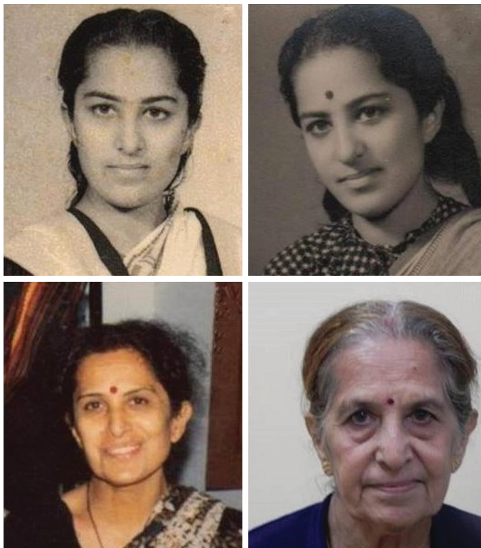
Fig. 5. Sequential photographs of a woman from West Indian ethnic group (1).

gets enhanced by bone resorption of the mandible and loss of lip volume. All this contribute toward the sagging of the overlying skin, leading to variability of ethnocentric features of both facial structures and beauty. 8