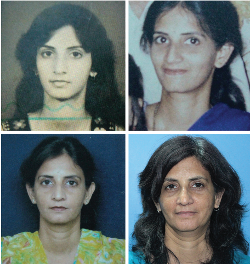
Fig. 4. Sequential photographs of a woman from the East Indian ethnic group.