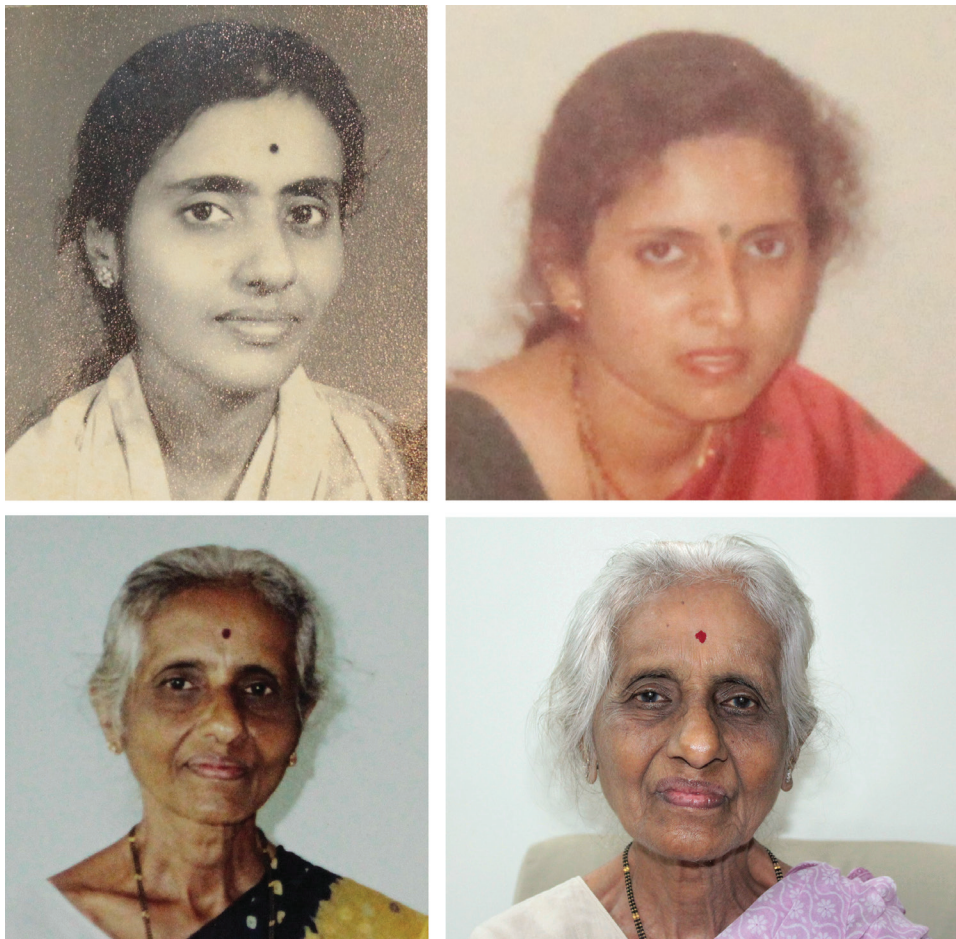
Fig. 2. Sequential photographs of a woman from the South Indian ethnic group.

This study followed the Declaration of Helsinki rules and secured Institutional Review Board approval from the ethics committee of The Esthetic Clinics, India. All N = 300 participants (75 per Asian Indian subgroup ethnicity) were above 30 years of age. Participants from different races and different locations of India (North, South, East, and West) were distributed equally in each regional group. The sample size was calculated using single population proportion formula: n = (Z\alpha/2)^2 p(1 - p)/d^2 , by considering the following assumptions: Z\alpha/2 = 1.96 (standard score value for 90% confidence level), P = 0.5 (since there is no similar study conducted in the study setting) in India, and d (tolerated margin of error) = 5.6%. Then, finite population correction