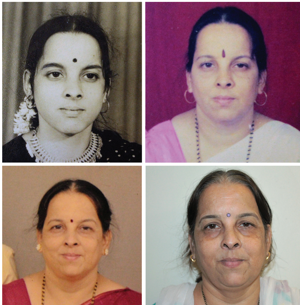
Fig. 3. Sequential photographs of a woman from the North Indian ethnic group.

Changes in each third of the face were noted, and age-related grading of change was performed on a scale of 1–5. For assessing changes of aging, various parameters like nasolabial folds, forehead lines, crow's feet, marionette lines, and tear troughs were taken into consideration. For the same, a validated scoring, ie, Carruthers' grading scale was used. 7 It is a 5-point grading scale (0–4) with 0 indicating no signs of aging and 4 indicating maximum aging at that age.