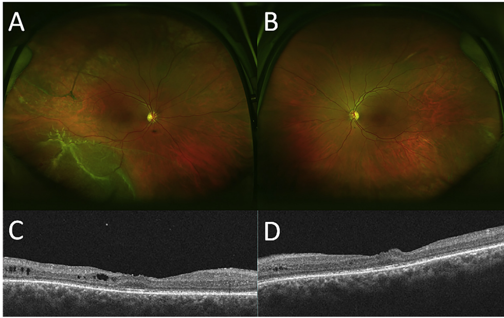
Fig. 1. Initial fundus photo of the right eye (A) showing inferior retinal detachment with vitreous stranding. Normal fundus photo of the left eye (B). Initial optical coherence tomography of the right eye (C) and the left eye (D) demonstrating flat macula with chronic changes of x-linked retinoschisis with minimal atrophy.