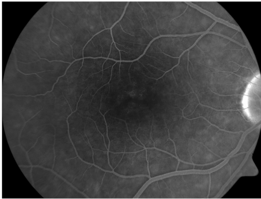
Fig. 2. Fluorescein angiography of the right eye demonstrating absence of petalloid leakage. The optical coherence tomography correlation is the horizontal scan found in Fig. 3A.

Two months later, the edema recurred with stable VA. He was observed. Next month, his VA was stable at 20/80, however there was progression of the intraretinal fluid with a typical schizoid appearance of vertically elongated columns in the retina. He was started on ketorolac and prednisolone. Six weeks later, there was no change in the OCT on topical treatment so was retreated with IVTA and the intraretinal fluid improved one month later. (Figs. 3 and 4).