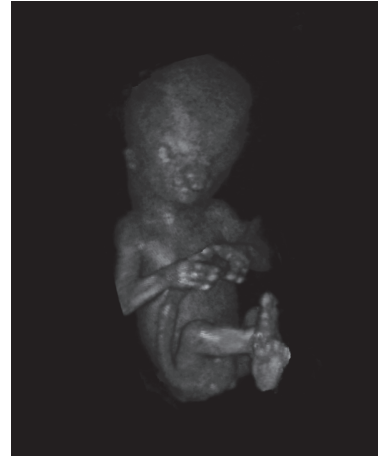
FIGURE 1: 3D transvaginal ultrasound dataset of a fetus with an ectrodactyly ectodermal dysplasia-cleft (EEC) syndrome visualized in Virtual Reality. Bilateral split hands and split feet are seen as well as bilateral cheilognathoschisis. An overriding aorta with a ventricle septum defect was diagnosed additionally.

The 3D volumes were converted to Cartesian volumes, using 3D software (4D View, GE Medical Systems, Zipf, Austria), and transferred to the BARCO (Kortrijk, Belgium) I-Space VR system at the department of Bioinformatics of Erasmus MC University Medical Center Rotterdam. This is a four-walled CAVE™ like VR system in which investigators are surrounded by stereoscopic images. A “hologram” of the ultrasound data is created by the V-Scope [25] volume rendering application (Erasmus MC, Rotterdam, the