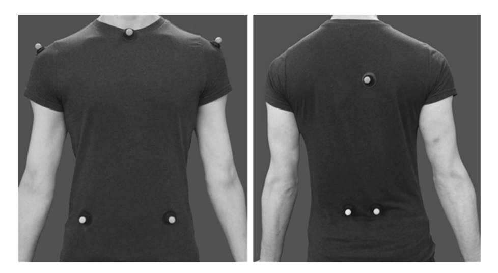
Fig. 1 Left the anterior view of marker placements, showing retroreflective markers placed on the acromion process of both shoulders (thorax reference point), the suprasternal notch (thorax reference point) and the crests of the anterior iliac spines (pelvis reference point). Right the posterior view of marker placements, showing retroreflective markers placed on the posterior crests of the iliac spines (pelvis reference point) and a tracking marker placed right of the spine on the upper back (overall reference point)

treadmill. Cameras were calibrated using a coordinate frame positioned on the treadmill and a hand held wand containing markers of predefined distances [for our motion capture software; Qualisys Track Manager (QTM)].