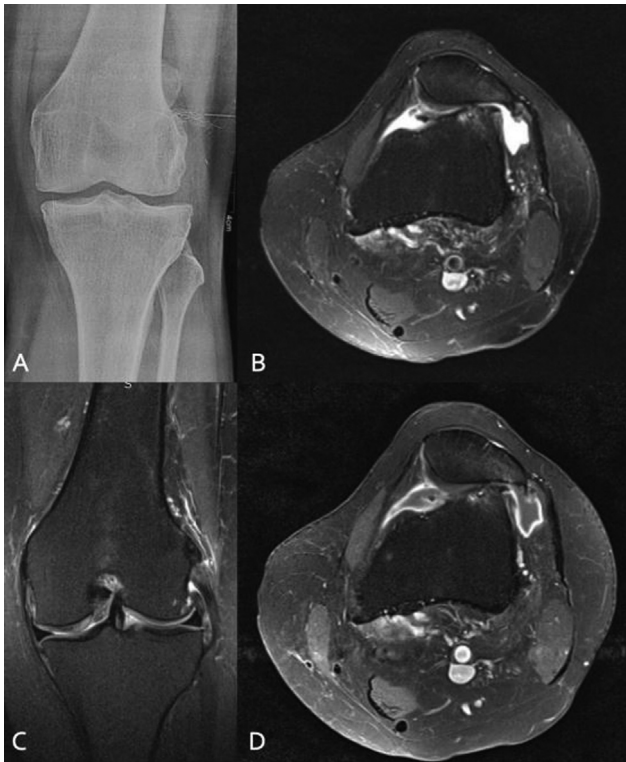
Fig. 2 A 44-year-old female with left knee pain. (A) X-ray left knee (anteroposterior view) showing no significant abnormality. (B) Proton-density (PD) fat-saturated axial image showing mild joint effusion with lateral patellar subluxation with degenerative changes in the lateral femoral condyle and lateral patellar facet with thinning and fraying of the patellar cartilage. (C) PD fat-saturated coronal image showing thickened hyperintense lateral collateral ligament with small subchondral cysts in the lateral femoral condyle. (D) Postgadolinium T1-weighted axial image showing synovitis.