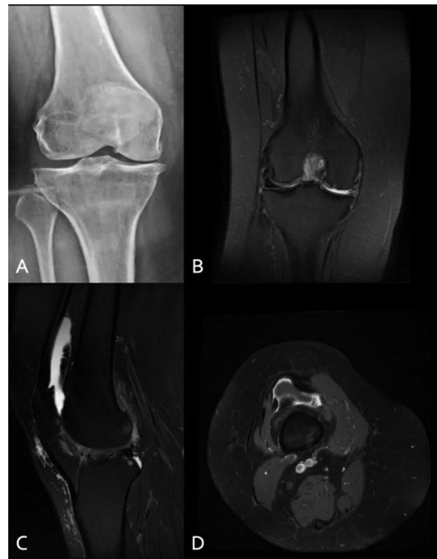
Fig. 1 A 59-year-old female with right knee pain. (A) X-ray right knee (anteroposterior view) showing reduction of joint space (medial > lateral) with marginal osteophytes. (B) Proton density (PD) fat-saturated coronal image showing cartilage loss and exposure of subchondral bone in the medial femoral condyle and medial tibial plateau. (C) PD fat-saturated sagittal images showing reactive joint effusion, patchy marrow edema in medial femoral condyle (D). Postgadolinium T1-weighted axial image showing synovitis.

Obesity is a well-known risk factor for symptomatic knee OA and weight management is considered important