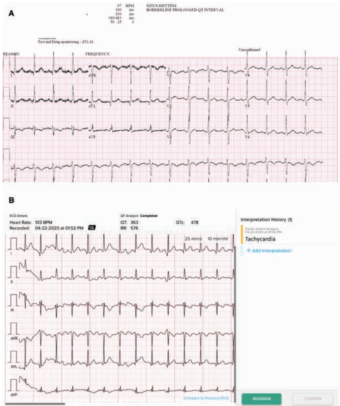
Figure 2: Representative ECGs and mECGs from two patients. A: ECG from patient 2. B: Six-lead mECG from patient 2. Note that the automatic rhythm interpretations are correct and the QTc intervals are less than 500 ms. Note that 40-ms vertical gridlines have been added to aid in the ability to measure the QT interval manually.

revealed similar automatic rhythm interpretations and QTc interval calculations.