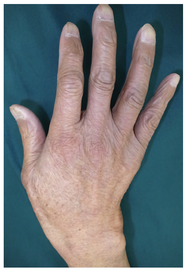
Figure 5. Photograph of the right hand 12 months postoperatively. The patient was satisfied with the appearance of the reconstructed hand.