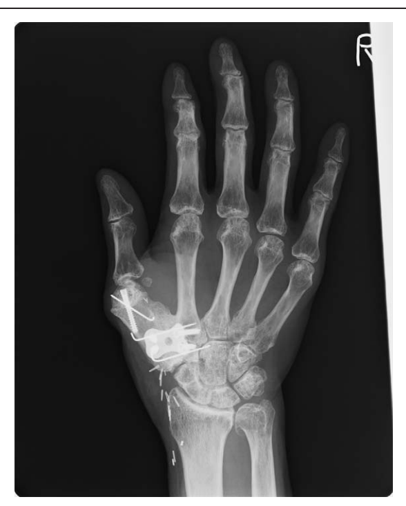
Figure 7. X-ray image of the right hand 12 months postoperatively. The grafted scapular bone had become united with the second metacarpal bone and trapezium.