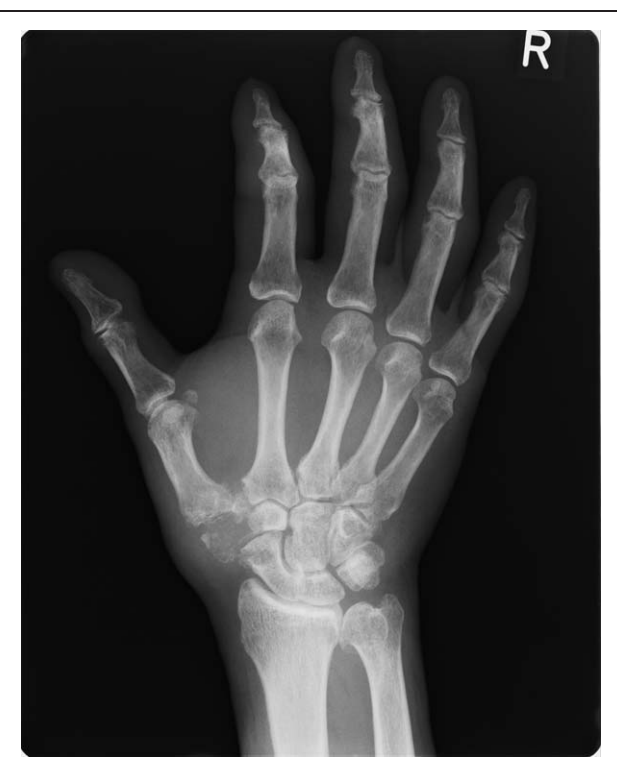
Figure 2. X-ray image of the right hand at the initial visit. The patient had an osteolytic lesion in the trapezium.