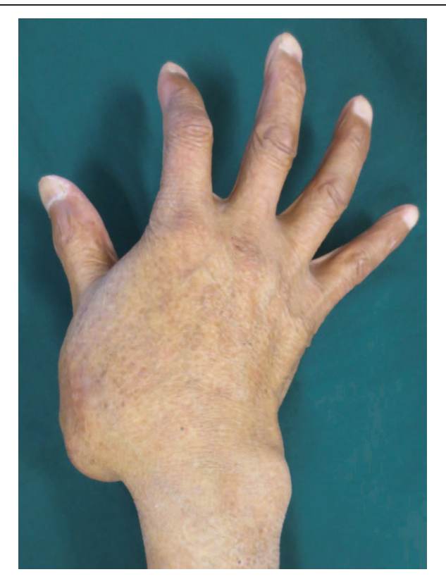
Figure 3. Photograph of the right hand prior to surgery. The patient complained of an unaesthetic appearance of the right hand.