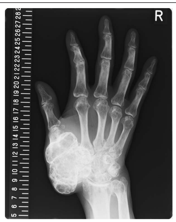
Figure 4. X-ray image of the right hand prior to surgery. The metastatic lesion to the trapezium had increased in size, formed new bone resembling a birdcage, and become involved the first metacarpal bone.