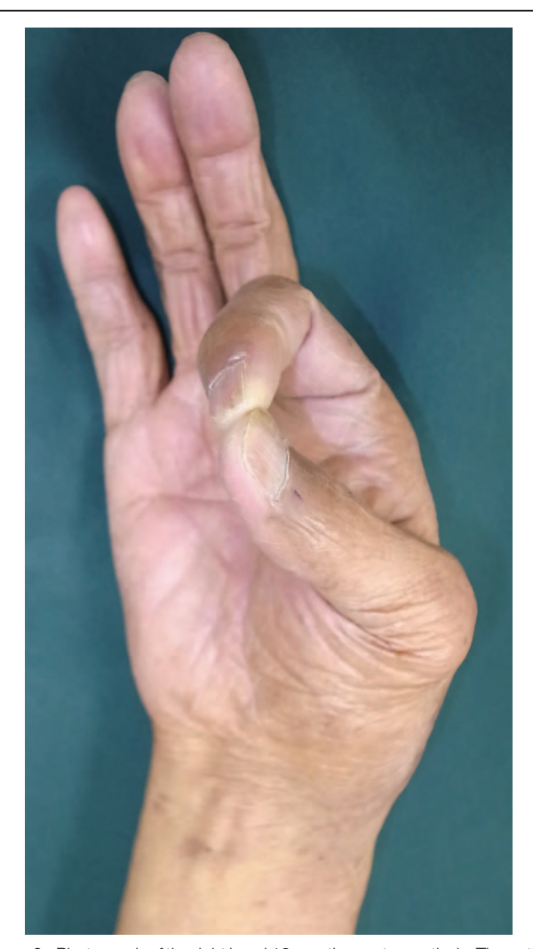
Figure 6. Photograph of the right hand 12 months postoperatively. The patient was satisfied with the function of the hand.

size of the gastric cancer had substantially decreased and that no other distant metastases were present. Histological analyses of specimens obtained by multiple needle biopsies of the right hand revealed no viable tumor cells. The patient complained of an unaesthetic appearance of the right hand and a tingling sensation over the dorsal thumb. The thumb and wrist function were well preserved in spite of the huge size of the base of the thumb. The Disabilities of the Arm, Shoulder and Hand (DASH) score was 21.67, and the side pinch power in the right hand was 8.7kg.