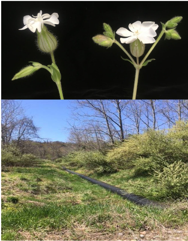
Figure 1. Top panel: Silene latifolia flowers from our study site: female (left) and male (right). Flowers open at dusk and are pollinated by night-flying moths (Jürgens et al. 1996). Flowers on females have wider calyces, weigh more, and are fewer in number than those on males (Delph 2007). Bottom panel: view of the clearing in early spring 2018, showing the pipe that was laid in 2015.