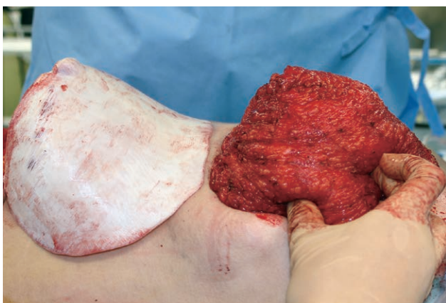
Fig. 2. Using the breast mold as a guide, a thick breast mound is created by tacking the flap surface on the caudal side.

Among the 8 flaps, 4 were single-pedicle (unilateral deep inferior epigastric vessel) flaps and 4 were double-pedicle (bilateral deep inferior epigastric vessel) flaps. Mean weight of the transplanted flap was 598 g (range, 447–779 g). In all cases, the flap was engrafted without any major perioperative complications during both the initial and DIEP flap surgeries. One patient had partial necrosis of the flap, 1 developed minor infection of the donor site, and 3 developed donor-site seroma. The patient with partial necrosis of the flap had a history of smoking, and the patients with minor infection and seroma of the donor site had obesity problems (body mass index > 27). Cosmetic outcomes were mostly satisfactory (excellent, 6 cases; good, 2 cases). Of the 2 patients with good outcomes, 1 had softening of the inframammary fold, and the other had insufficient breast thickness due to skin envelope contraction.