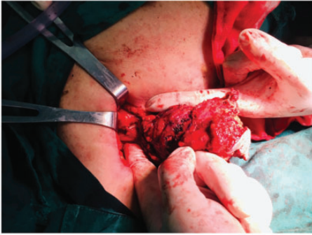
Figure 2. Intraoperative separation of the neoplasm.

space instead of the PECS2. The SAPB block method, which is conventionally administered at PECS2, was modified to provide better lateral chest wall analgesia. The serratus anterior extends from the second to the eighth rib, and occasionally, reaches the ninth rib, covering the intercostal muscle. 5 We injected local anesthetic superficially on the serratus anterior surface rather than a deep injection for two reasons. First, consistent with Blanco et al.'s report, 4 superficial SAPB showed wider dermatomal distribution of sensory loss. In a cadaveric study, Biswas et al. 6 reported that superficial SAPB at the level of the fifth rib in the midaxillary line showed dye staining in the axillary region in 18.2% of cases, whereas no staining was observed in the axillary region in any patient with deep SAPB. Second, based on an anatomical document, the mechanism of SAPB appears to be associated with blockade of the lateral cutaneous branch rather than the root of the intercostal nerve. 7 The intercostal nerve is mainly distributed on the thoracic and abdominal walls; it continues from the paravertebral nerve, extends through the intercostal muscles, and then divides into the cutaneous branch and muscular branch before passing the serratus anterior muscle. Its lateral cutaneous branch passes through the lateral chest wall to the surface