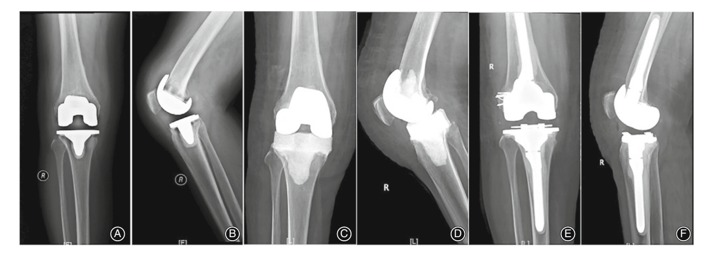
Fig. 4 Female, 56-year-old, underwent two-stage revision of the right knee joint with culture-positive periprosthetic joint infection. (A, B) preoperative X-ray: prosthesis loosening; (C, D) one-step postoperative X-ray; (E, F) second-step postoperative X-ray

A 56-year-old woman had CP PJI of the right knee. The pathogen was MRS, for two-stage revision, and no recurrence was found in the follow-up so far. According to the drug sensitivity test, the antibiotic regimen was determined by intravenous administration of vancomycin for 6 weeks, followed by oral administration of linezolid for 1 week, and myelosuppression occurred, but the side effects disappeared after stopping the use of antibiotics (Figure 4).