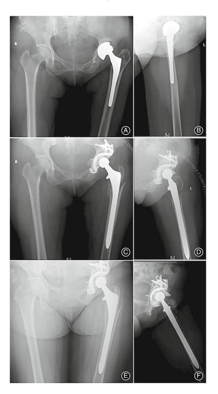
Fig. 3 Female, 54-year-old, underwent one-stage revision of the left hip joint with culture-negative periprosthetic joint infection. (A, B) preoperative X-ray: prosthesis loosening; (C, D) postoperative X-ray; (E, F) reexamination X-ray 2 years after operation

Orthopaedic Surgery Volume 14 • Number 7 • July, 2022