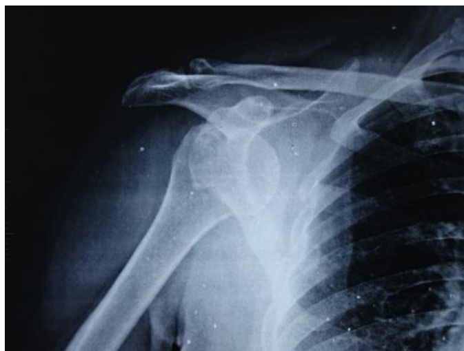
Figure 1: X-ray suggestive of right shoulder dislocation.

After doing closed reduction and confirming the reduction on X-ray, the patient was admitted for further management. History was suggestive of the first episode of dislocation in 2006 following trauma after which the patient had recurrent episodes every year. There was no hypermobility at joints as well as no neurovascular defect. He had a known case of hypertension and diabetes mellitus and was on medications for the same. Computed tomography (CT) scan of right shoulder was suggestive of coracoid process fracture, bony defect in the postero-superior aspect of the right humerus, and bony fragment seen in the antero-inferior aspect of the glenoid region (Fig. 2a and b). Bone loss was calculated with the best-fit circle method and was approximately 35%. Magnetic resonance imaging (MRI) is suggestive of minimally displaced coracoid fracture. Hills Sach lesion and bony Bankart lesion. After proper pre-operative workup, the patient was planned for open