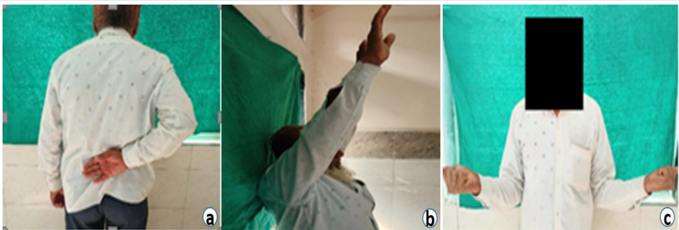
Figure 4: (a-c) Range of motion: Internal rotation, forward elevation, and external rotation at 1-year post-operative.

With limited data published on cases of anterior shoulder