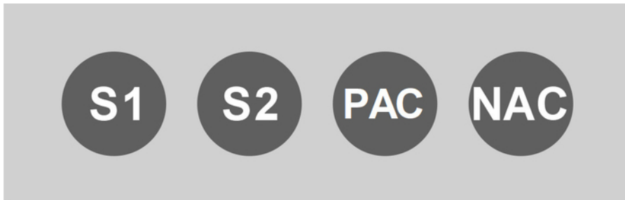
Figure 1: Visualization of the experimental set-up of a ready-to-use B. tabaci LAMP kit described in the protocol. S1, sample 1; S2, sample 2; PAC, positive amplification control; NAC, negative amplification control. Please click here to view a larger version of this figure.

A subset of the assays (N = 13) was performed under on-site conditions at the Swiss POE Zurich Airport by plant health inspectors using the ready-to-use B. tabaci LAMP kits 8 . When cross-validated in the reference laboratory, all results from on-site testing were found to be correct (test efficiency = 100%) 8 . Assessing the on-site LAMP assay performance, the average time to positive (time until a positive results was available) was 38.4 \pm 10.3 min (mean \pm standard deviation) 8 . A representative DNA amplification plot and the corresponding annealing derivative from a B. tabaci LAMP analysis performed under on-site conditions are shown in Figure 3A and B . In this example, sample one and two were correctly identified as B. tabaci indicated by DNA amplification after approximately 30 min ( Figure 3A ) together with the expected annealing temperatures at approximately 82 °C ( Figure 3B ).