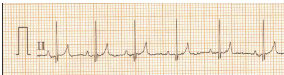
Figure-1: Normal electrocardiograph (Lead-II, 25 mm/s and 10 mm/mV) of Labrador dog.

ECG parameters for different breeds of trained dogs such as Labrador Retriever, German Shepherd, and Golden Retriever have been reported [16]. However, the correlations of ECG values with sex, age, and body weight were not clearly understood. Thus, this study was established to examine them in detail. Reference values of ECG parameters for Labrador Retrievers and German Shepherds in this