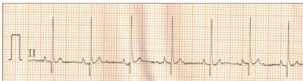
Figure-2: Normal electrocardiograph (Lead-II, 25 mm/s and 10 mm/mV) of German Shepherd dog.