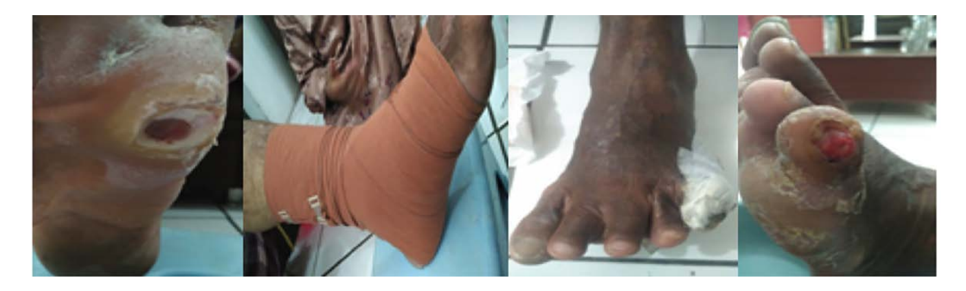
Figure 3. Wound on 16 November 2019.