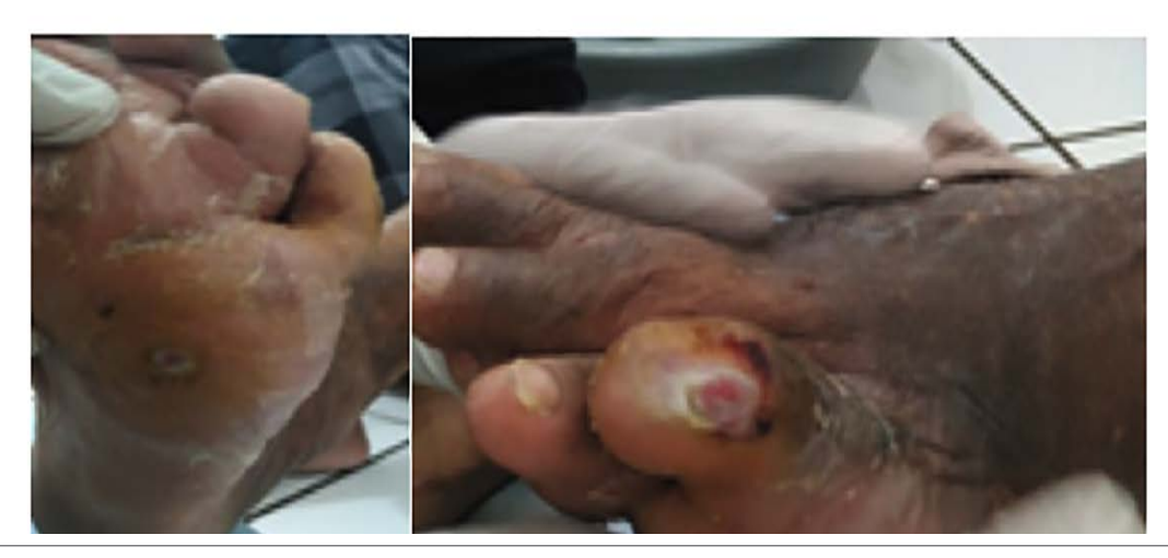
Figure 4. Wound on 30 November 2019.

Home-based interventions play an important role in improving patient and family self-care management with mobility impairment due to DFU and the elderly. Strengthening families through involvement in each intervention can help assist patient with monitoring. Understanding the reasons for the recurrence of diabetic ulcers by early assessment of biological and behavioral factors is important to prevent the remission. Increasing foot care practices and behavior changes are the key component to reduce the risk of ulcer recurrence and reduce the burden on patient and families.