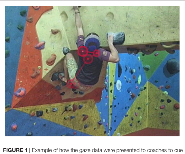
FIGURE 1 Example of how the gaze data were presented to coaches to cue retrospective think-aloud: visual gaze data super-imposed as 2-s scan path [a connected string of fixations (circles) and saccades (connecting lines)] to cue verbal responses (i.e., why coaches focus on specific fixation locations).

analysis software. Using the BeGaze RTA function, the cued RTA interviews were conducted immediately after the collection of gaze data using video replay with the gaze data super-imposed to cue verbal responses. After viewing the gaze data in real time, the participants were asked to scroll through gaze data at 25% speed, explaining why they focused on specific fixation locations and their relevance to the analyses. The fixations discussed were self-selected by the participant in order to reduce researcher bias. The gaze data were replayed until each coach had exhausted all fixations they could recall.