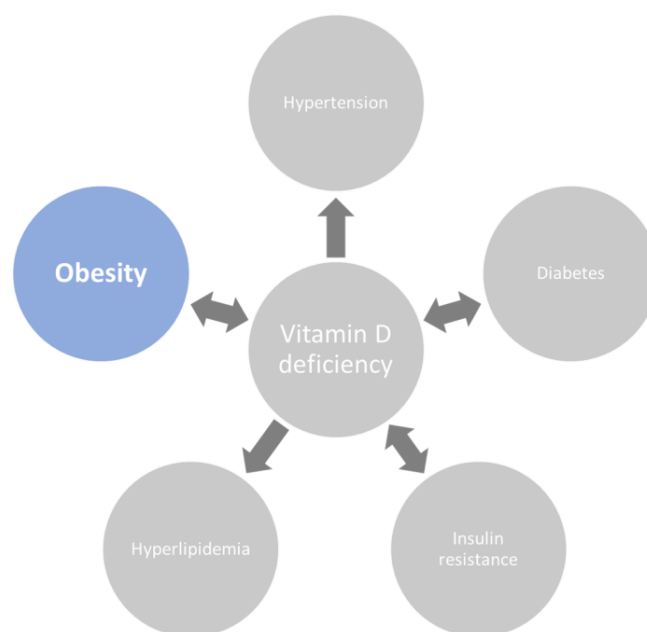
Figure 1. Vitamin D deficiency is strongly related to obesity as well as to other components of adiposity-related dysmetabolic state.

Low VD is also associated with poor health behaviors. Recently, its deficiency has been associated with a large number of disorders such as metabolic syndrome, cancers, and autoimmune, psychiatric, and neurodegenerative diseases, but the causative role of VD deficiency in many of these conditions remains unclear [7]. Since VD deficiency is related to visceral adiposity; it could be used as a biomarker of a visceral adiposity-related dysmetabolic state (cardiovascular diseases, type 2 diabetes, dyslipidemia, arterial hypertension) (Figure 1). Nevertheless, its independent role in the development and progression of these diseases cannot yet be excluded, due to changes in the expression of genes regulated with VD receptors. Moreover, as stated below, in VD deficient subjects, the lack of possible anti-inflammatory effects on chronic low-grade inflammation could lead to an enhanced risk of obesity-related metabolic disorders.