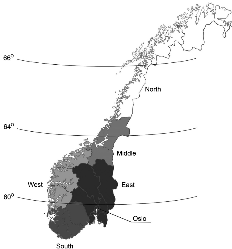
Figure 1. Map of Norway, illustrating the position of the five geographical regions; South, East, West, Middle, and North.

2011 and the rate was higher in males than in females during the entire study period (Table 1). However, the age-specific rate for the age group 30–49 years was higher in females than in males after about 2000. The increase in the SCC incidence rate was almost linear over time in both sexes. APC was 5.6% (95% CI 4.5, 7.3) in females and 3.3% (95% CI 1.3, 5.3) in males. An increase in SCC incidence rate was seen in all age groups over 30 years of age, but the most striking increase was observed in the age group 70–79 years.