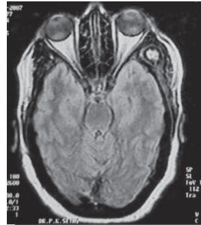
Fig. 2 Axial T1 weighted MRI with contrast showing a 1.1x1.3 cm intramuscular enhancing lesion in the left temporalis muscle.