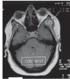
Fig. 1 Axial T1 weighted MRI with contrast showing a 1.1x1.3 cm intramuscular enhancing lesion.

Routine laboratory testing is generally unremarkable in cysticercosis. The diagnosis rests on characteristic imaging findings supported by serologic tests such as enzyme-linked immunosorbent assay (ELISA) and enzyme-linked immunoelectrotransfer blot (EITB). The sensitivity of serum ELISA