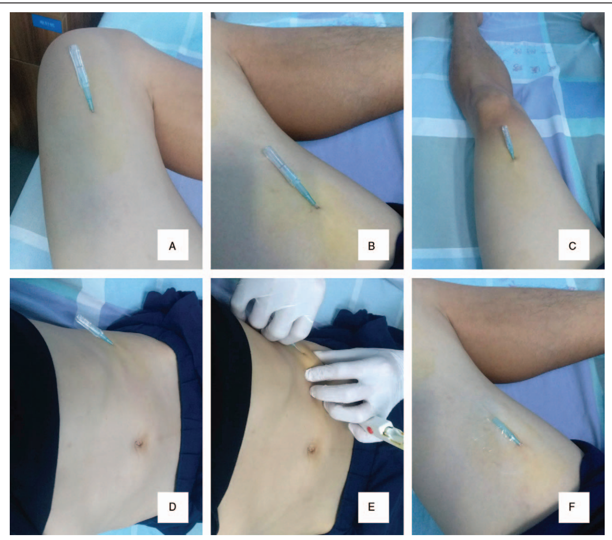
Figure 2. The Fu's subcutaneous needling insertion points were on left medial head of quadriceps (A), adductor muscle (B), rectus femoris (C), and intra-abdominal oblique muscle (D). The needles were horizontally moved, smoothly and rhythmically, from one side to the other (E). The steel needle was then withdrawn and insertion points were covered with a 6 \times 7 cm transparent dressing (F).

Yu et al. Medicine (2019) 98:38 www.md-journal.com