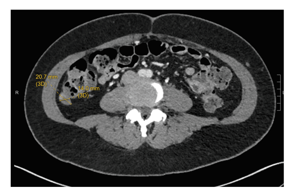
Fig. 2C. Month 26 of megace/tamoxifen treatment. Peritoneal implant 2.1 \times 1.4 cm.

showed a greater clinical benefit compared to the patient's prior therapies, which included an aromatase inhibitor and a gonadotropinreleasing hormone agonist. Meurs and colleagues described 31 adult GCT patients with an overall response rate of 71.0% to endocrine therapy, including 18 partial responses and 8 complete responses (van Meurs et al., 2014). One patient was treated with an alternating regimen of megestrol acetate and tamoxifen with a complete response at 22 months. In contrast to our case, this patient was ER negative and PR positive (Hardy et al., 2005). Second, our patient's treatment was interrupted twice due to rising inhibin levels and presumed resistance to endocrine therapy. However, re-initiation of the same hormonal regimen after both treatment interruptions showed significant clinical efficacy, suggesting a re-sensitization during the treatment break. While the mechanisms underlying the development of resistance to endocrine treatment are unclear, it is possible that the continuous treatment with megestrol acetate and tamoxifen modified the ER and PR pathways. Megestrol treatment might have induced a down-regulation of PR expression and signaling, and thus rendered tumor cells resistant to the pro-apoptotic effects of progesterone. The treatment interruption might have reconstituted an ER/PR expression profile that re-sensitized the tumor cells to endocrine treatment.