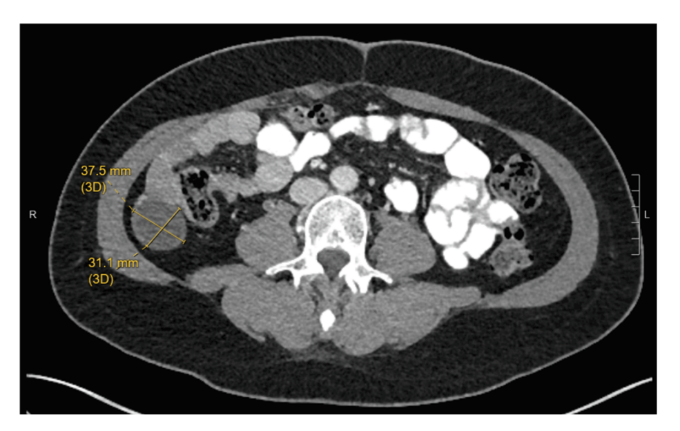
Fig. 2B. Month 15 of megace/tamoxifen treatment. Peritoneal implant 3.8 \times 3.1 cm.

GCT (NCT01042522). Adjuvant radiotherapy may prolong disease free survival (Wolf et al., 1999). Anti-angiogenic therapy using bevacizumab has demonstrated some clinical activity with stabilization of disease in up to 78% of relapsed cases (Brown et al., 2014). Immunotherapy using the PD-1 inhibitor pembrolizumab has recently shown a potential clinical benefit in adult GCT with disease control of over 12 months (How et al., 2021).