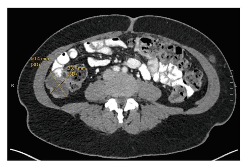
Fig. 2A. Prior to megace/tamoxifen treatment. Peritoneal implant 5.0 \times 3.4 cm.