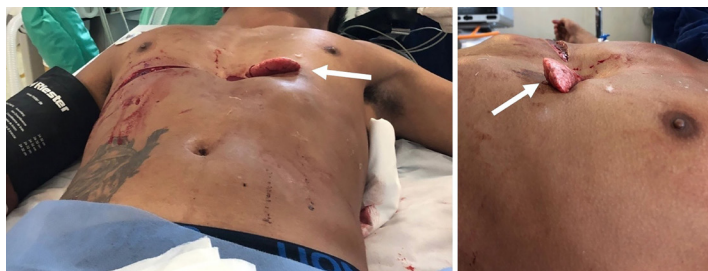
Image 2. The lingula of the lung can be observed protruding beyond the penetrating injury of the thorax, expanding with each inspiration (arrows).

initial hemoglobin of 13.6 grams (g) per deciliter (dL) (reference range: 12.0 – 16.0 g/dL).