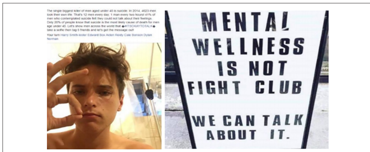
Figure 1. Facebook posts about mental health.

concepts of health and identity, (c) focused attention on social determinants of health and conditions for success, (d) strength in relationships with family and (e) the importance of friends and mates. These themes are presented in more detail in the following text.