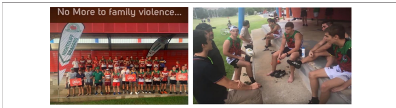
Figure 2. Examples of outreach health education activities posted on Facebook.

being reluctant to seek help and unlikely to disclose mental health concerns.