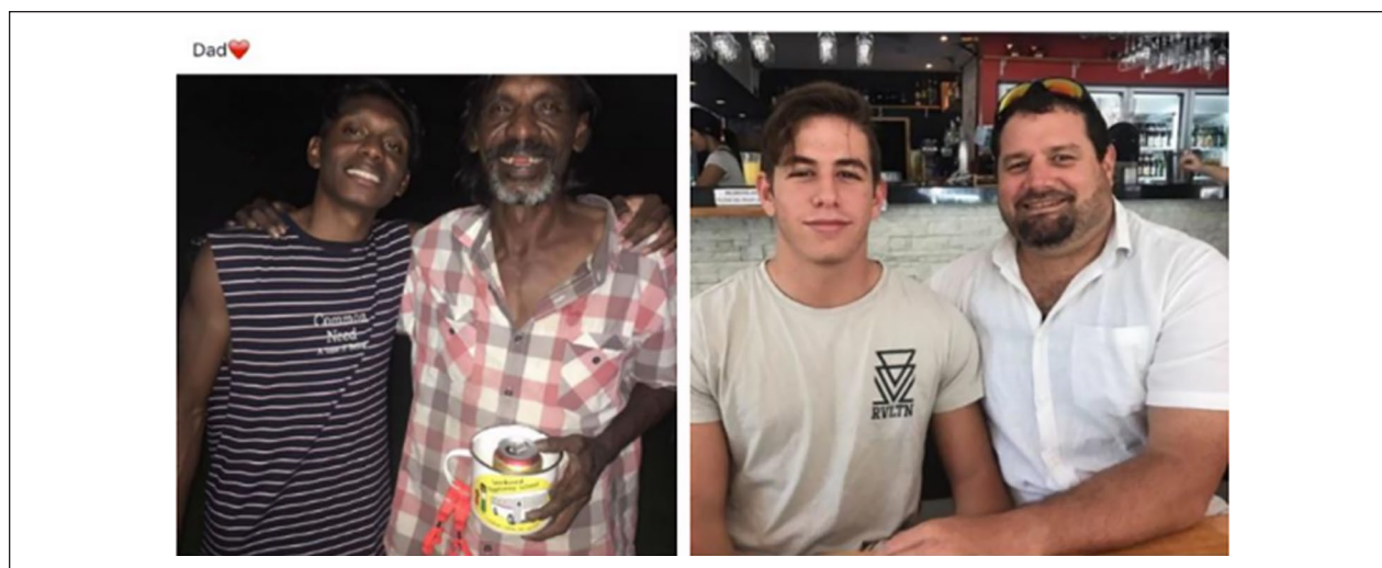
Figure 3. Facebook posts with fathers.

This commentary reflects the documented mainstream experiences of Australian men (Smith et al., 2008a). Formal biomedical explanations of health outcomes, when unadjusted to patient needs and expectations, hinder health literacy development at an individual level. Other help-seeking options were mentioned in addition to health services. Confidantes such as friends, coaches, teachers and bosses were canvassed. These confidantes were reported as enquiring about and expressing interest in the lives of the young Aboriginal and Torres Strait Islander males participating in the study. This was generally respected by members of this cohort who articulated an inclination to respond positively by sharing their health issues and concerns with significant others. One Yarning Session contributor reflected: