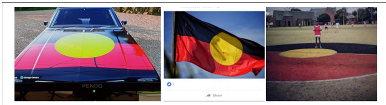
Figure 6. Facebook posts reflecting sovereignty through images of the Aboriginal flag.

a family atmosphere because of the playground. There was sport on and there was a restaurant there as well. . .there is a kitchen. I'm not sure what state it's in now. But it's the only kind of sporting ground that has club rooms with a restaurant. (Yarning Session 2, Katherine)