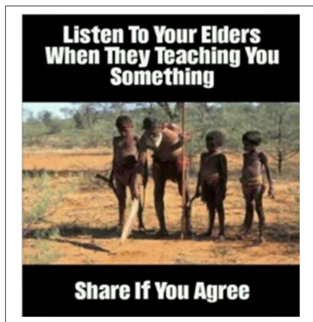
Figure 5. Facebook post relating to respect for Elders.

In remote contexts, cultural lore was occasionally related to health outcomes too. One Yarning Session participant, for instance, mentioned: