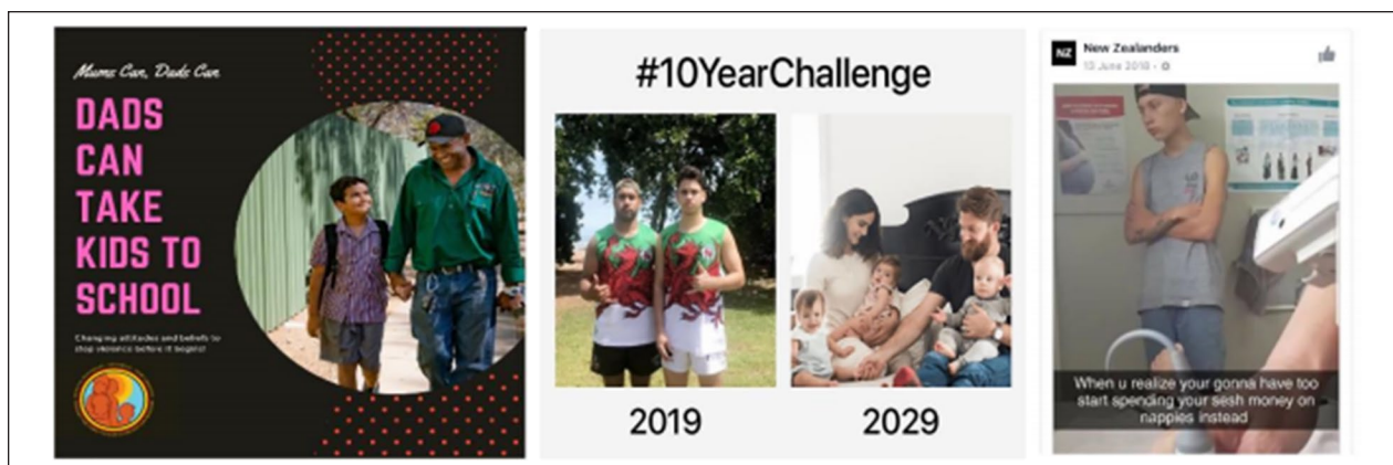
Figure 8. Facebook posts reflecting contemplation of fatherhood.