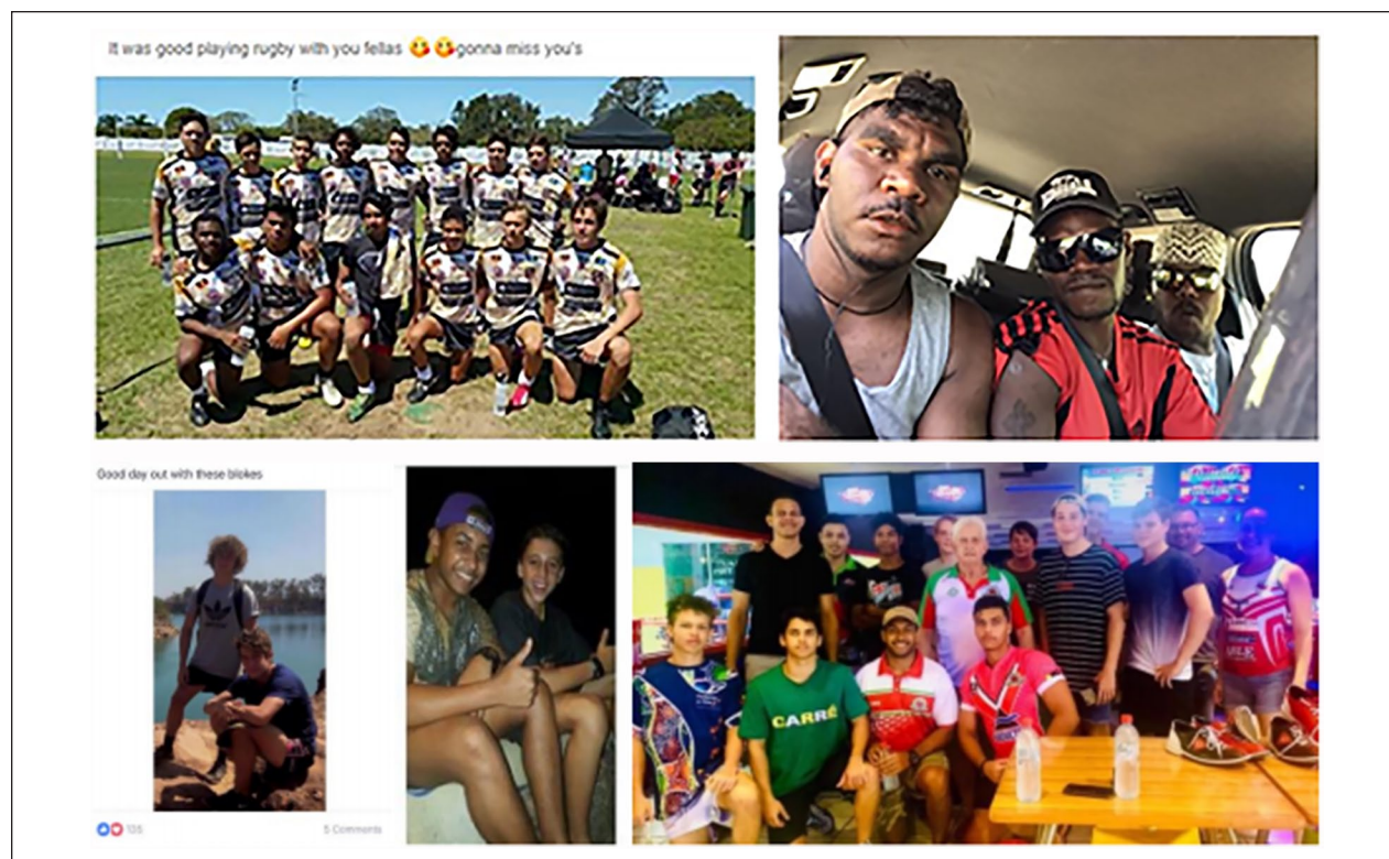
Figure 9. Facebook posts with friends and mates.

it is evident that emerging concepts relating to Indigenous masculinities – particularly those tied to notions of connection to country and the intergenerational exchange of information – are reflected in their data (Antone, 2015; Darcy, 2016; Mukandi et al., 2019).