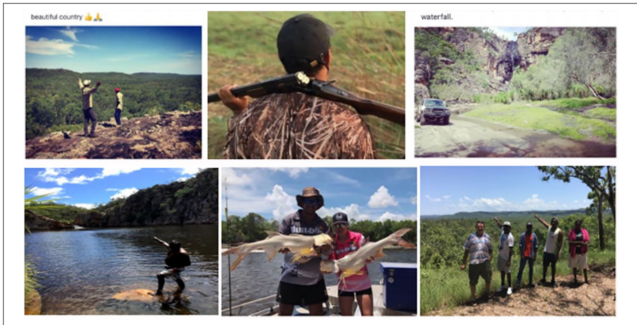
Figure 4. Facebook posts reflecting on-country activities such as fishing and hunting.

concepts of health and their respective influence on identity formation. The importance of engaging with cultural practices on country – particularly fishing and hunting – was raised throughout all nine Yarning Sessions. Facebook posts and images frequently reinforced this message too (Figure 4). Some participants spoke about ‘bush foods’ and ‘bush medicine’ as important aspects of their health and cultural identity. Magpie, geese, buffaloes, fish and crocodiles all featured in Facebook images, underscoring the cultural significance of these hunting practices. Such responses reflect an expression of masculinity rooted in cultural connection to country unique to Aboriginal and Torres Strait Islander peoples. Interestingly, there were minimal images of plant-based bush foods or medicine despite an increased focus on their therapeutic qualities in popular media and scientific discourse. This could reflect traditional gender roles and respective gender-related activities tied to cultural practices in some remote community settings across Northern Australia.