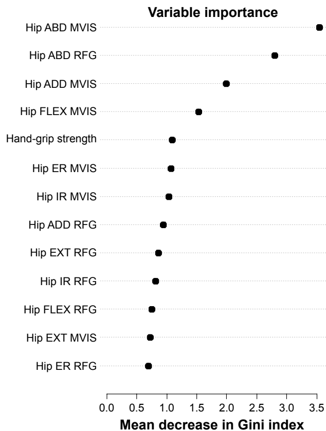
Figure 2 Mean decrease in Gini index sorted by decreasing variable importance from top to bottom. The two most important variables are the maximum voluntary isometric strength and rate of force generation of the hip abductors.

Abbreviations: MVIS, maximum voluntary isometric strength; RFG, rate of force generation; ABD, hip abductors; ADD, hip adductors; FLEX, hip flexors; EXT, hip extensors; IR, hip internal rotators; ER, hip external rotators.