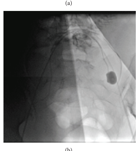
FIGURE 3: A series of images acquired during the placement of the catheters using shielding. (a) right internal iliac artery and (b) left internal iliac artery.

the IIABO catheters using the C-arm, resulting in a lower total radiation dose. In therapeutic radiology, steps should also be taken to minimize the radiation beam so that it affects only the area of interest [13]. We used shielding to ensure minimal fetal radiation exposure during the placement of the internal iliac catheters (Figures 3(a) and 3(b)).