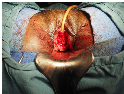
Fig. 3 The flaps are closed to create the neourethra

through a single small lateral incision made 2 cm above the epicondyle of the knee. Sutures of 0-polypropylene (Prolene™; Ethicon) were placed at the two ends of the fascial strip and passed through the vaginal incision into the retropubic space using a tonsil clamp and out through the abdominal wall through a single midline suprapubic incision. The passage of the clamp through this space was continually guided with a fingertip. Passage of the sling was done before closure of the neourethra to avoid inadvertent injury to the delicate repair. After neourethral reconstruction, the sling was positioned at the level of the bladder neck and secured in place using sutures of 3–0 polyglactin 910 (Vicryl™; Ethicon). The sling was tied under very light tension to avoid creating an obstruction and the skin was closed under minimal tension to complete the repair. In two cases, a fibromuscular sling as described by Browning was used instead of a fascia lata sling, at the discretion of the operating surgeon [8]. In this technique, the lateral vaginal sidewall is opened, the ischiocavernosus muscle is mobilized bilaterally, the two ends of the muscle are brought together in the midline just under the (neo)urethra, and they are then sutured to one another to form the supportive sling [9].