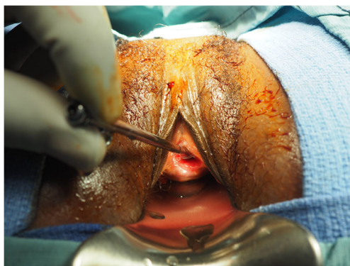
Fig. 1 Urethra amputated by gurya cutting. Metal sound within the urethral stump at the bladder neck

chart review was obtained from the medical director of the Danja Fistula Center. Because it involved only a review of medical records, the project was regarded as not requiring further monitoring. The charts were reviewed and pertinent clinical and socio-demographic data were extracted. Only 10 cases of fistula resulting from genital cutting procedures occurred out of a total of 360 cases seen in the period from March 2014 to September 2016. The other cases were all of obstetrical origin. These cases have been described elsewhere in detail [6]. Nine of the 10 genital cutting cases involved a total loss of the urethra and the remaining case was a rectovaginal fistula from a cutting procedure. All 10 cases can be categorized as instances of gurya , a local form of traditional cutting therapy carried out for a variety of gynecological complaints.