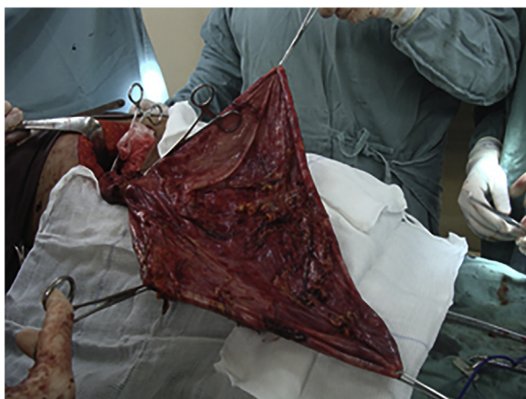
Fig. 2. Resection of the bile duct cyst.

The most common symptoms of bile duct cysts are abdominal pain, fever and jaundice, but their diagnosis is often an incidental finding. The incidental finding of an early stage gallbladder neoplasm allows, in most cases, a better prognosis [8]. A suture or mesh repair should be performed in small and large defects respectively [9]. In this case, although there was a large defect, the resection of the cyst allowed a Mayo repair without tension.