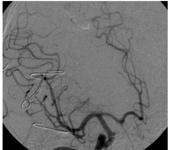
FIG. 3. Intraoperative angiogram showing exclusion of the aneurysm and patent distal vessel.

MRI is an important aid for surveillance of recurrence of GBM after treatment. 4 However, imaging can often be confounded by radiographic changes caused by tumor therapies as opposed to the tumor itself. 4 Notably, these include pseudoprogression, 5 but other changes, including vascular changes, are rarely reported. 6–10