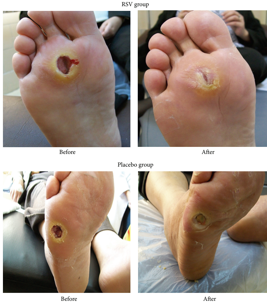
FIGURE 2: Ulcer images before and after 60-day resveratrol or placebo treatment.